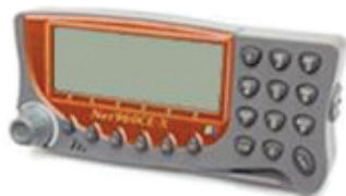
Rugged Vehicle Mounted Terminals