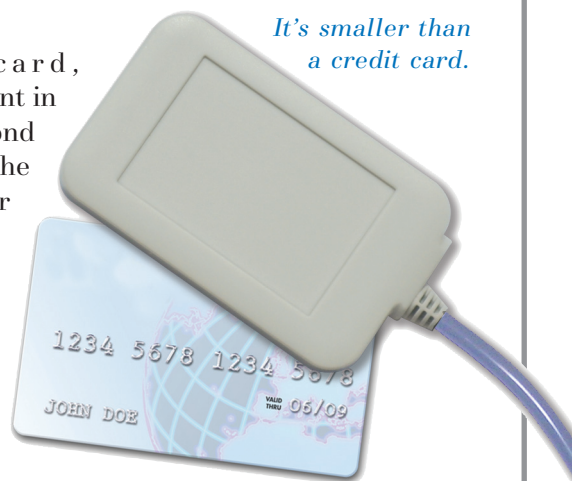
It's smaller than a credit card.